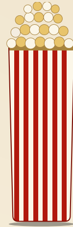
Large 20 cups